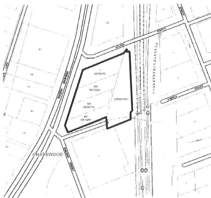
Figure 1 Site Aerial Map

The controls contained in this site-specific Development Control Plan applies to the land 849-859 Pacific Highway, 2 Wilson Street and 8 Wilson Street (also known as Lot 1, O'Brien Street) Chatswood. The land is bounded by Pacific Highway to the west, Wilson Street to the north, O'Brien Street to the south and a rail line to the east as shown on the map below.